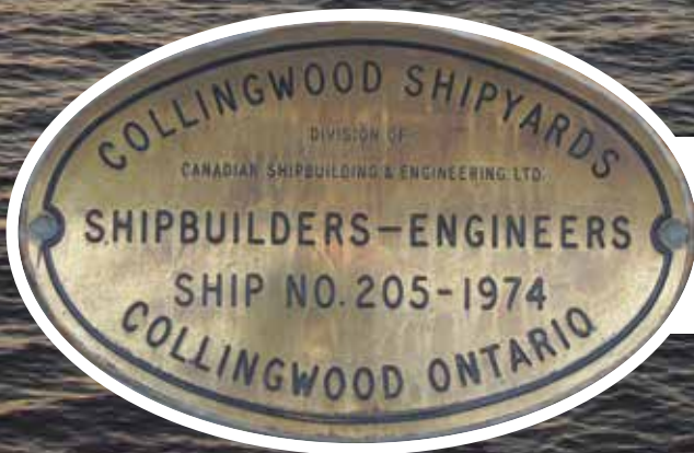
◀ On Jan. 12, 1974, the Chi-Cheemaun hull was launched in Collingwood by Collingwood Shipyards, Ltd.