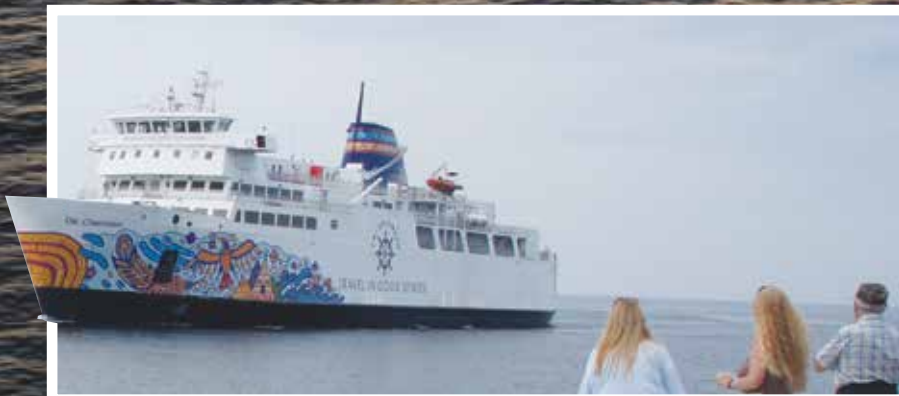
◀ MS Chi-Cheemaun coming into port at South Baymouth.