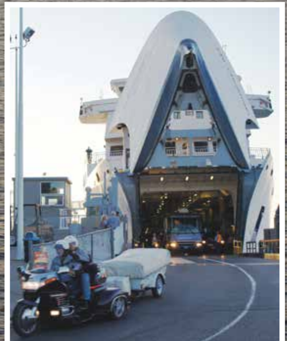
▲ Vehicles leave the parking deck at Tobermory.