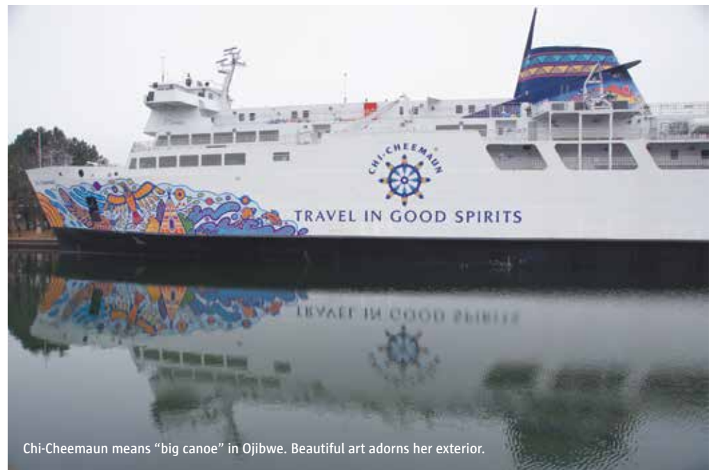
Chi-Cheemaun means "big canoe" in Ojibwe. Beautiful art adorns her exterior.

Kerry remembers one dramatic experience in particular. "We came into Tobermory on a bad weather day and cancelled the return trip to Manitoulin. I let crew go home and kept a small crew to stand by as it was really blowing a gale. Suddenly, one of the mooring cables broke and we were starting to fall away from the dock. We closed the car ramp quickly and started